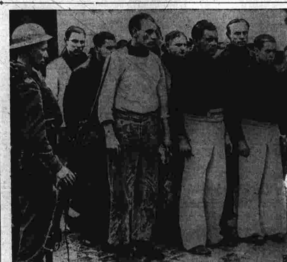
As a British soldier stands guard with fixed bayonet, survivors of the German battleship Bismarck, sunk by British warship and planes in the Atlantic west of France, arrive at an unidentified British port. (Photo transmitted by cable from London to New York.)